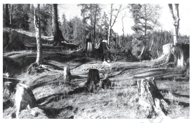
Fig. 7.3 Deforestation leads to land degradation, biodiversity loss and air pollution

deposits beneath the land surface, vast stretch of the Indian Ocean, ranges of mountains, etc. The black soil of the Deccan Plateau is particularly suitable for cultivation of cotton, leading to concentration of textile industries in this region. The Indo-Gangetic plains spread from the Arabian Sea to the Bay of Bengal — are one of the most fertile, intensively cultivated and densely populated regions in the world. India's forests, though unevenly distributed, provide green cover for a majority of its population and natural cover for its wildlife. Large deposits of iron-ore, coal and natural gas are found in the country. India accounts for nearly 8 per cent of the world's total iron-ore reserves. Bauxite, copper, chromate, gold, lead, lignite, diamonds, manganese, zinc, uranium, etc. are also available in different parts of the country. However, the developmental activities in India have resulted in