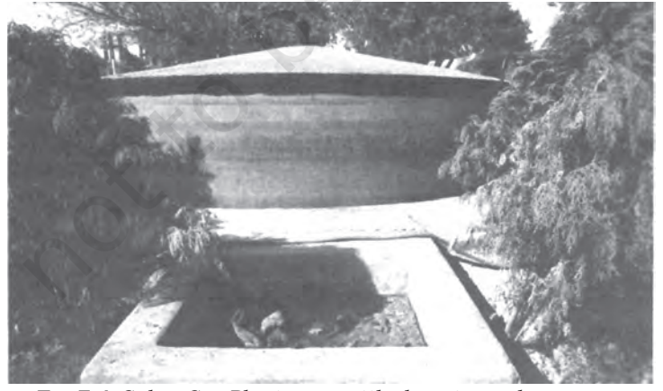
Fig.7.4 Gobar Gas Plant uses cattle dung to produce energy

Wind Power: In areas where speed of wind is usually high, wind mills can provide electricity without any adverse impact on the environment. Wind turbines move with the wind and electricity is generated. No doubt, the initial cost is high. But the benefits are such that the high cost gets easily absorbed.