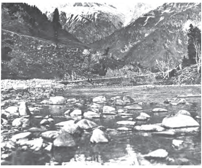
Fig. 7.1 Water bodies: small, snow-fed Himalayan streams are the few fresh-water sources that remain unpolluted.

functions is within its carrying capacity . This implies that the resource extraction is not above the rate of regeneration of the resource and the wastes generated are within the assimilating capacity of the environment. When this is not so, the environment fails to perform its third and vital function of life sustenance and